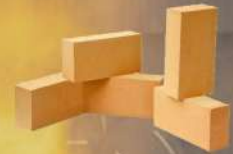
Refractory Castables and Fire Bricks