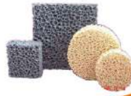
CERAMIC FOAM FILTERS