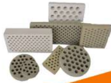
CERAMIC PRESSED FILTERS