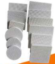
CERAMIC EXTRUDED FILTERS