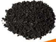
GRAPHITE FINES (GPC)