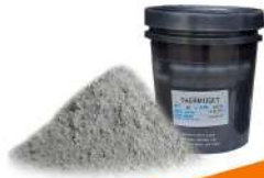
REFRACTORY JOINING PASTE AND FIRE CLAY