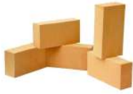
REFRACTORY FIRE BRICKS