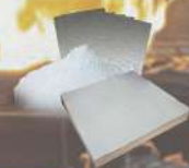
Furnace Lining Material